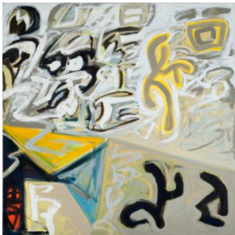
Bernice Bing, Blue Mountain No.4 1965.

http://gwenart.files.wordpress.com/2014/02/bing2.jpg