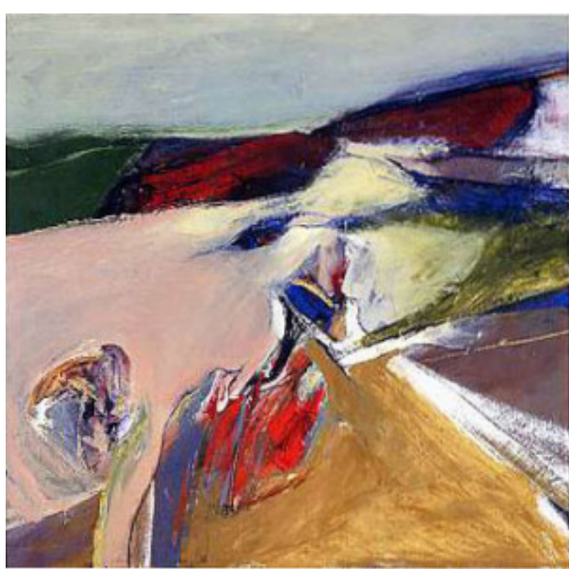
Abstract Calligraphy Mixed media, 35" x 24", 1987 Collection of Bernice Bing Estate

http://gwenart.files.wordpress.com/2014/02/bing4.jpg